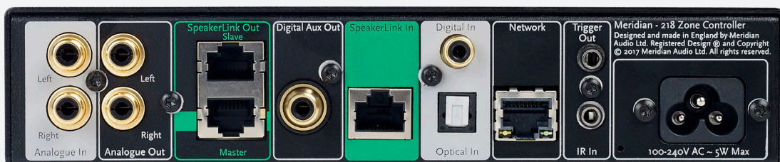
REAR PANEL LAYOUT

Master Quality Authenticated (MQA) is a revolutionary end-to-end technology that delivers master quality audio in a file that's small enough to stream or download.