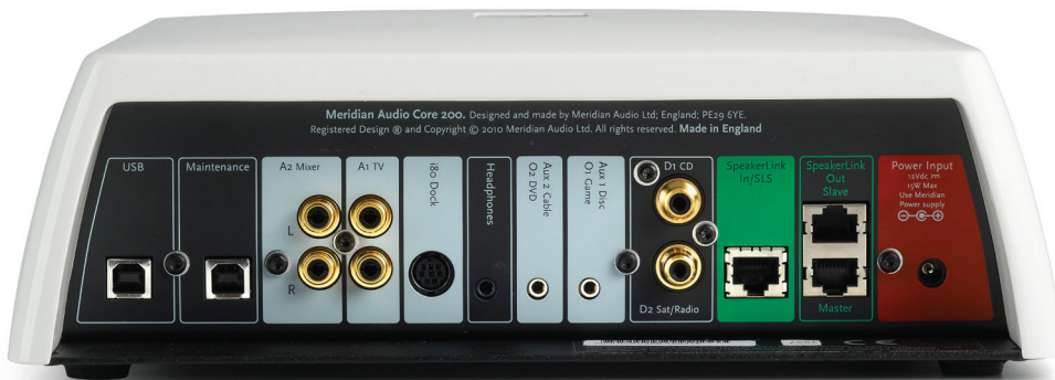
REAR PANEL LAYOUT

* These features are software version dependent.