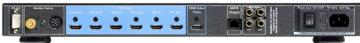
REAR PANEL LAYOUT

The processor also includes a configurable audio delay of up to 85ms to allow lip-syncing in the event that the display system introduces an appreciable delay into the video presentation.