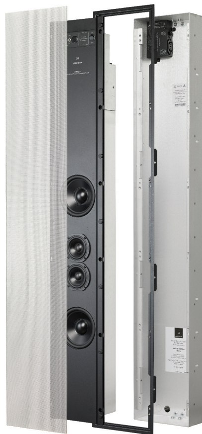
DSP640.2 Shown with RF600 rough-in box and grille

The DSP640.2 uses a new octo-amp design with a bridged pair of amplifiers for each of the four drive-units. Each pair of amplifiers is capable of delivering 100W RMS into 8 Ohms. A single DSP640.2 can deliver full-range sound at an SPL of 105dB at over 9m with bass extension down to 35Hz. With the latest DSP technologies from Meridian also on-board, including Enhanced Bass Alignment, Centre Elevation, Dynamic Bass Protection and L + R mode, the DSP640.2 is an ideal choice whether used in stereo systems, full surround-sound set-ups, soundbar applications or other single-speaker installations.